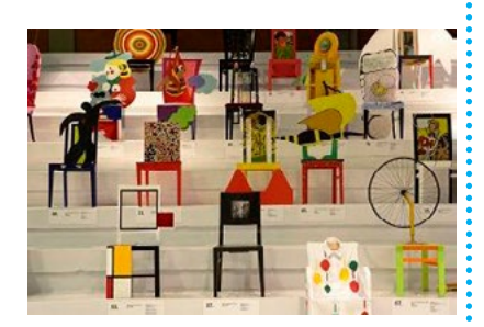
A picture from the project Art on chairs

chambers of commerce to businesses, municipal authorities, universities and schools, allowing the transfer of knowledge and expertise from local universities to the furniture industry. Total investment: € 1,095,535 (of which EU contribution through the ERDF: € 931 205).