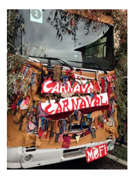
picture from <u>The management of the festive rituals</u> <u>in the public areas</u> project

The programme reaches individuals through organisations, institutions, bodies or groups that organise such activities. The specific conditions for the