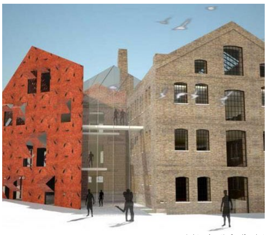
A picture from the Specifi project

Interreg Va provide 60-70% contribution to the total (eligible) project budget (i.e.