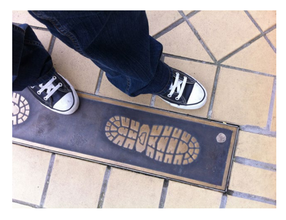
Walking in Hamish's footsteps - picture from the project <u>Time and Place</u>

Specific lists of potential beneficiaries of the projects are available for each investment priority in each programme but generally include SMEs, social enterprises and not-for-profit organisations, universities, intermediary agencies and local or regional authorities, and the general public including excluded populations or those at risk of exclusion.