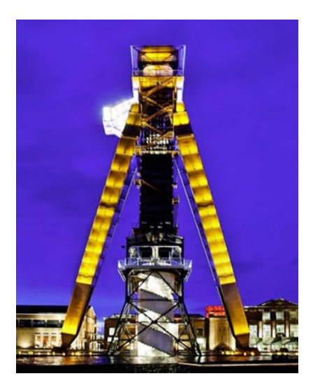
An image of the former coal-mining site in Genk, Belgium, transformed by the project <u>C-mine</u>)